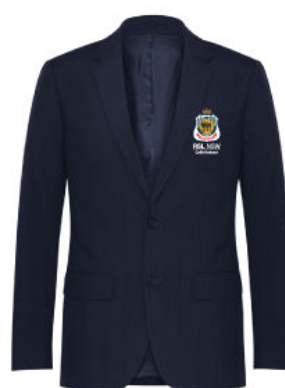
Jacket - $133.00