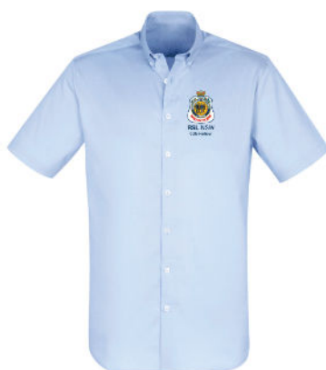
S/S Shirt – Est. $53.00