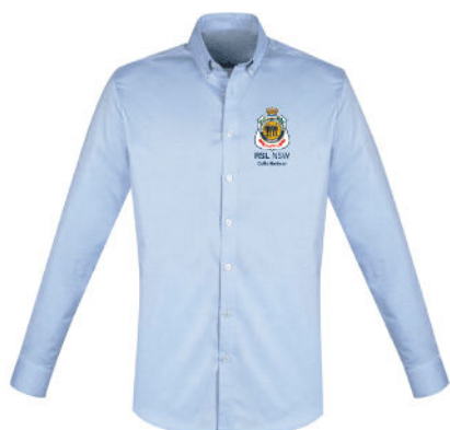
L/S Shirt – Est. $55.00

We are now resourcing women's versions of these items.