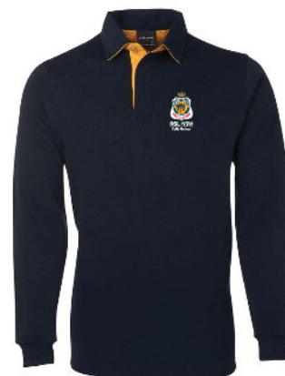
L/S Rugby – Est. $44.00