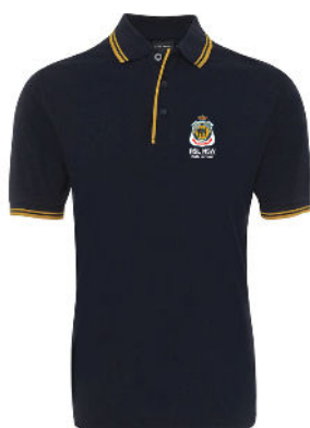
s/s Polo - $22.00