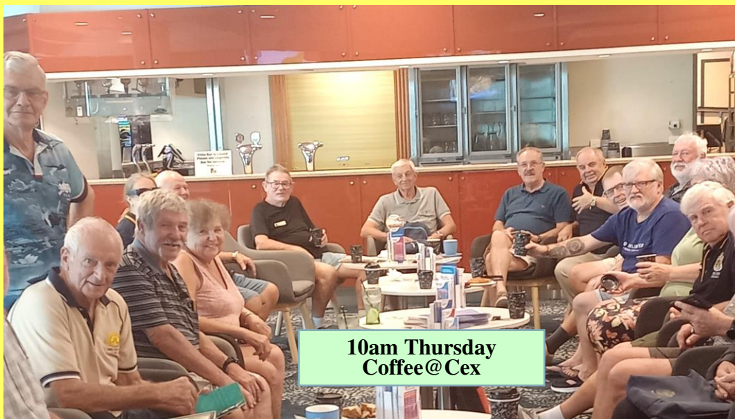
10am Thursday Coffee@Cex

Bowls at 10.00am on the Cex. Greens. Vets & friends