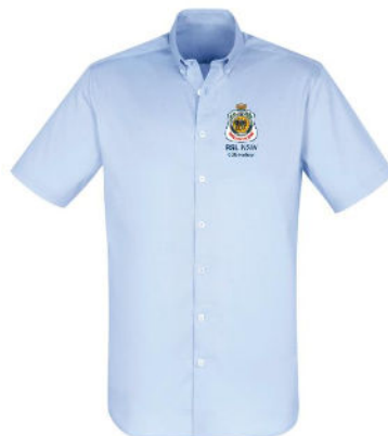
S/S Shirt – Est. $53.00