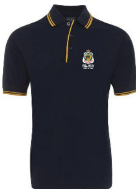
s/s Polo - $22.00