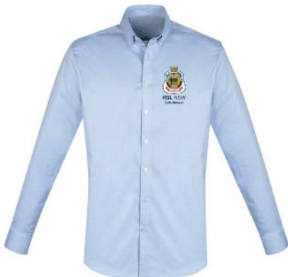
L/S Shirt – Est. $55.00

We are now resourcing women's versions of these items.