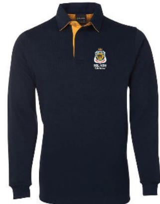
L/S Rugby – Est. $44.00