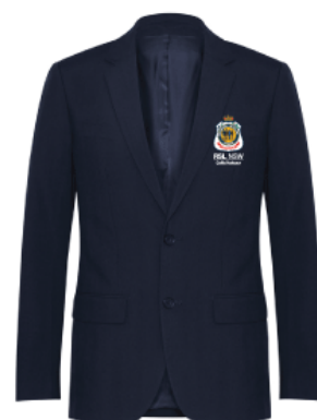
Jacket - $133.00