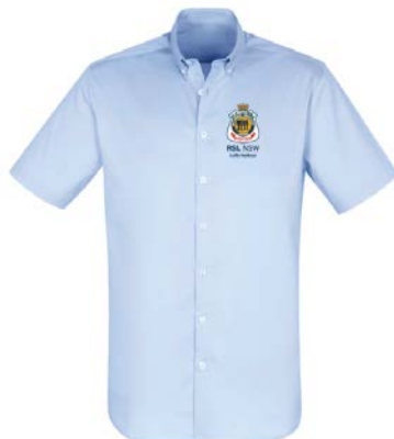
S/S Shirt – Est. $53.00