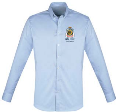
L/S Shirt – Est. $55.00

We are now resourcing women's versions of these items.