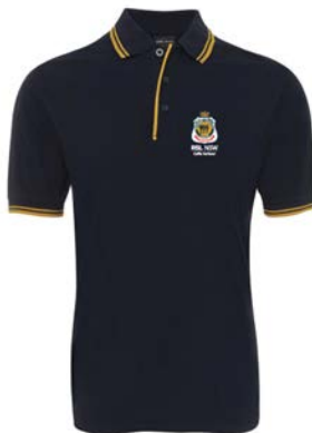
s/s Polo - $22.00