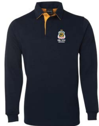
L/S Rugby – Est. $44.00