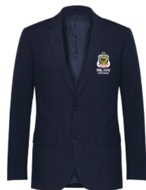
Jacket - $133.00