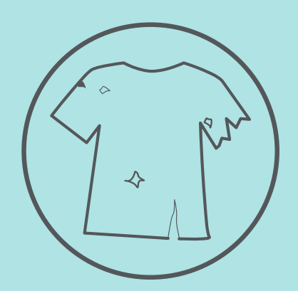
UNTIDY OR DIRTY CLOTHING